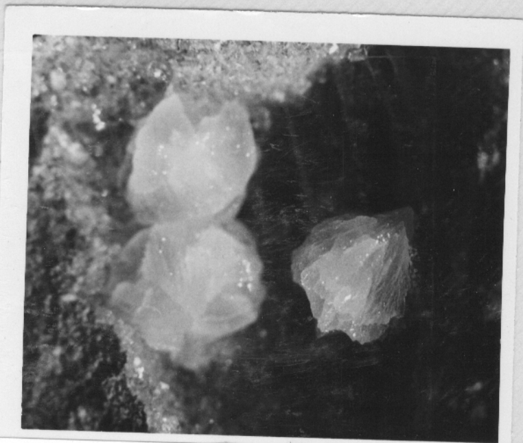
#3 - GISMONDINE - UPPER CLACKAMAS RIVER, OREGON