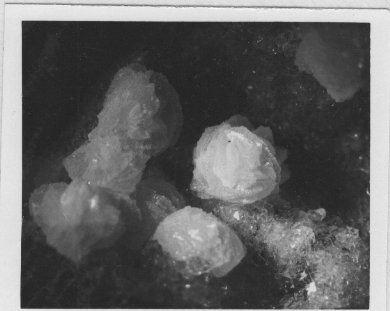
#2 - GISMONDINE - UPPER CLACKAMAS RIVER, OREGON