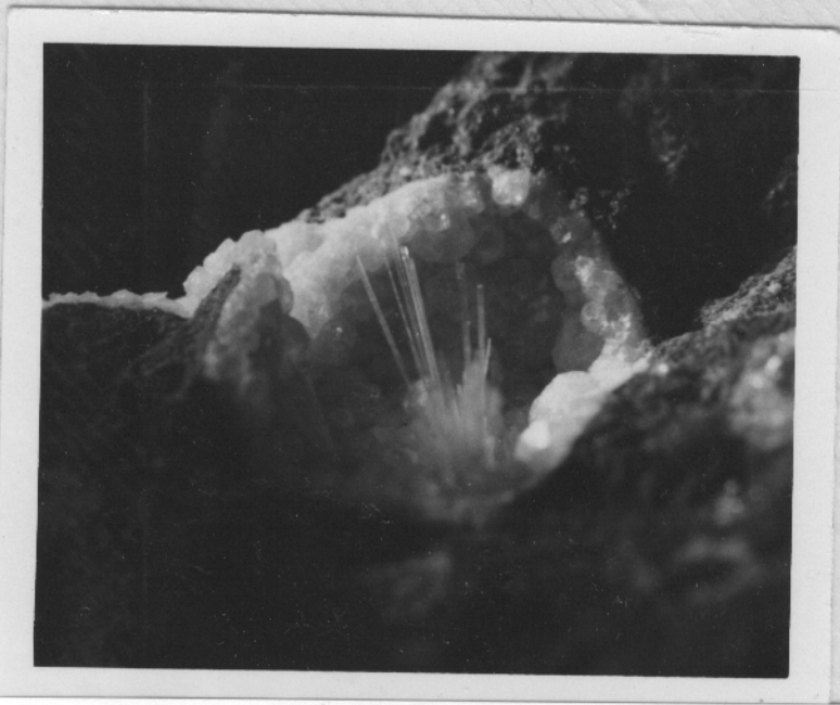
#1 - NATROLITE, ANALCIME - INDIAN ROCK LOOKOUT, OREGON -7X