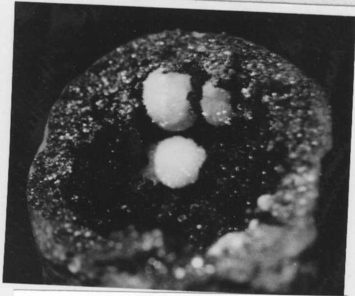
#5 - COWLESITE - YACOLT, WASHINGTON